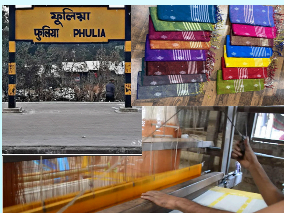
PHULIA SAREE MARKET- 38 KMS