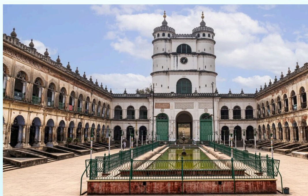
IMAMBARA HOOGHLY- 25 kms