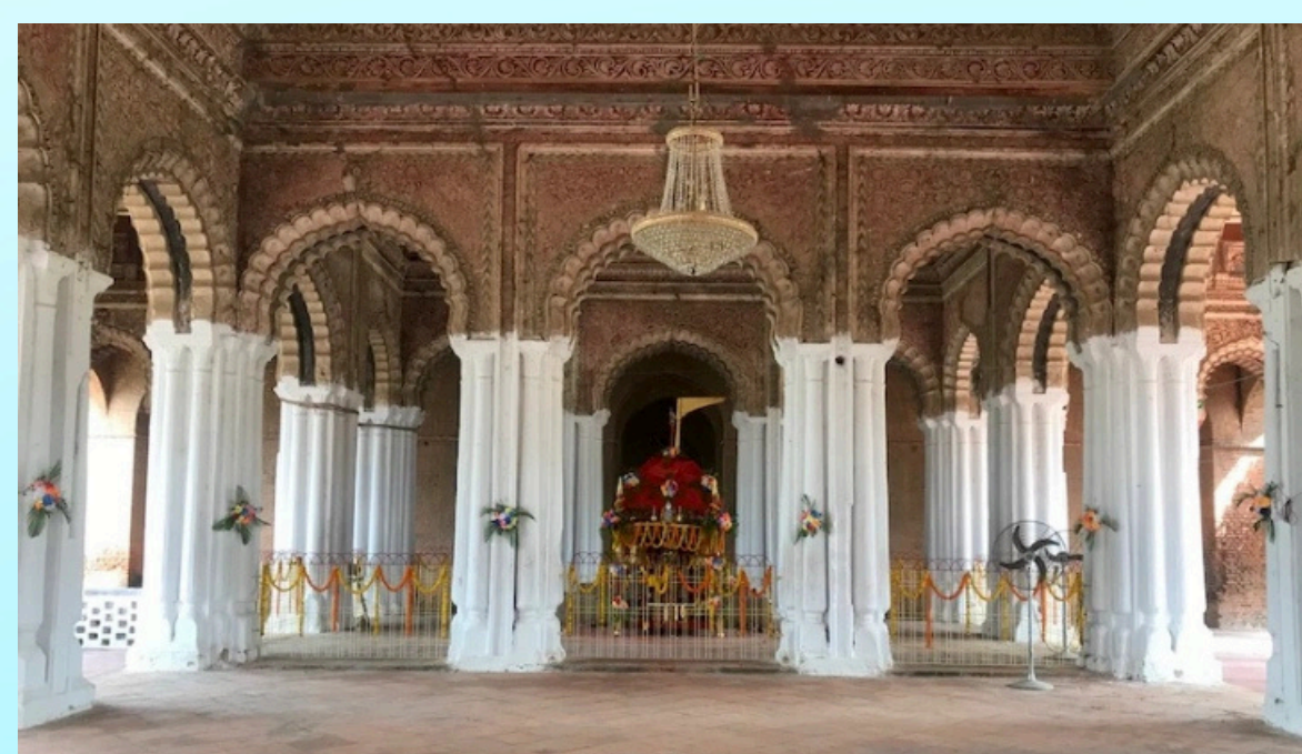
KRISHNAGAR RAJBARI- 62 KMS