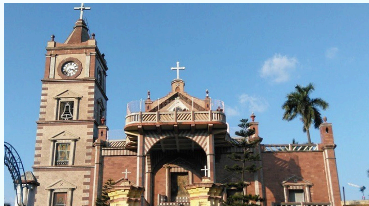
BANDEL CHURCH HOOGHLY-23 kms