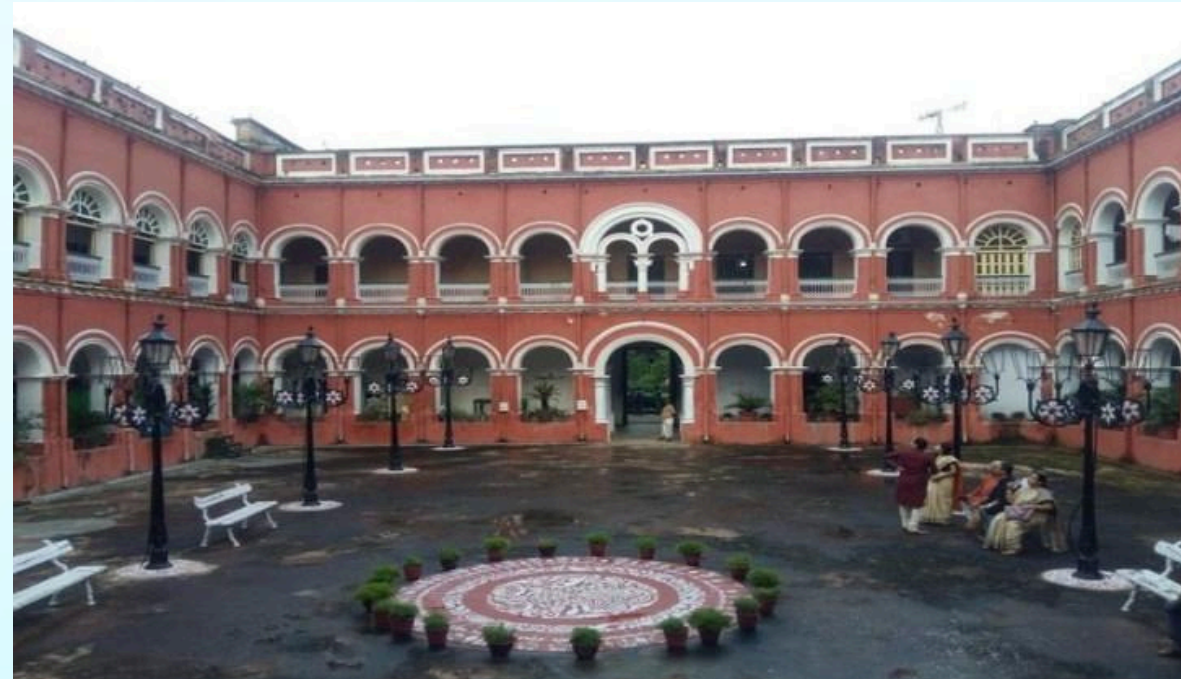
ITACHUNA RAJBARI -34 kms