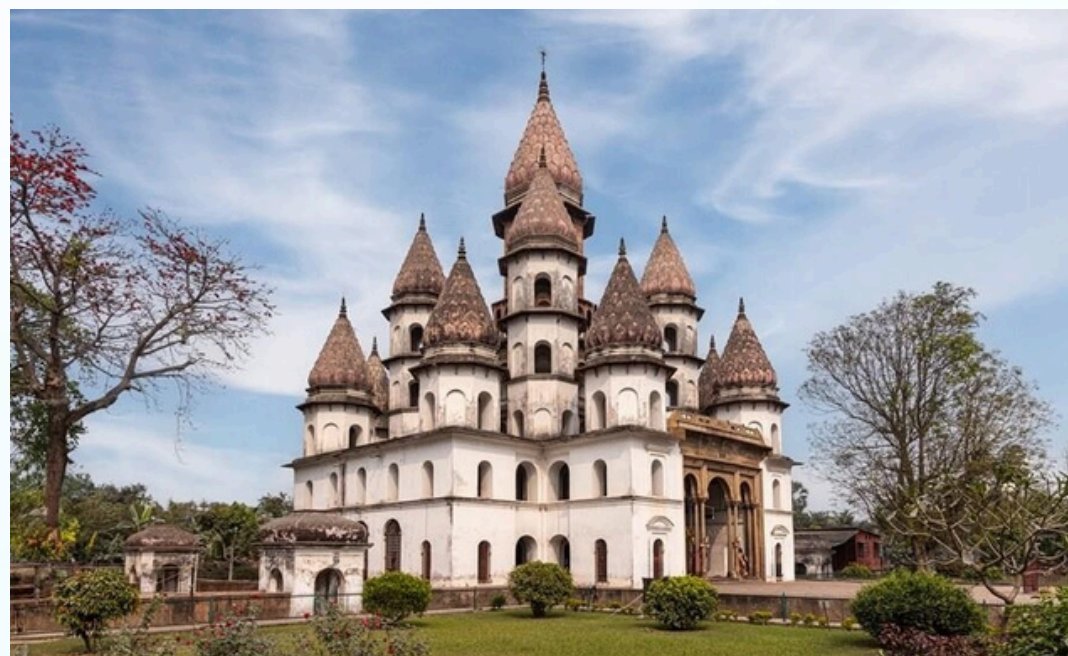
SHRI HANGESHWARI TEMPLE-18 kms